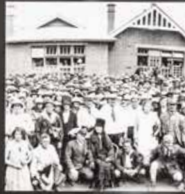
Horsham community gather for 'Back to Horsham' celebrations, 1929. Image: AHJ 000285

Past and present stories that define the identity of Horsham are featured on the reverse side of the sculpture.